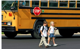
School's back in session— DRIVE CAREFULLY!

We received some exciting news from our Parade of Homes